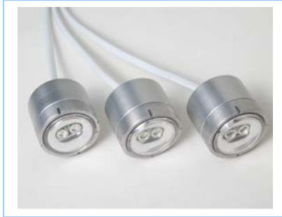
Model: LB1A Φ36.5 x 34.4 mm

BrightLite’s patent pending Ultra-BrightLite™ High Power LED lamps provide ease in maintenance, when individual LED Lamps replacement is necessary. The parallel connection eliminated total black out when one LED lamp is malfunctioning.