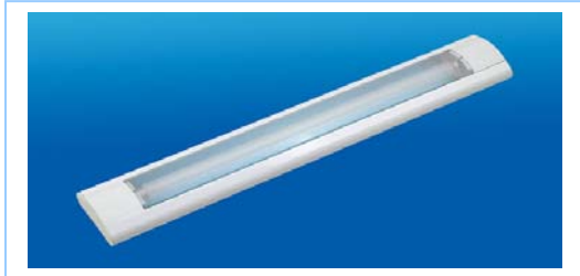
Model: DE4C & DE4C-S 585 x 115 x 45 mm

BrightLite's patent pending Ultra-BrightLite™ High Power LED lamps provide ease in maintenance, when individual LED Lamps replacement is necessary. The parallel connection eliminated total black out when one LED lamp is malfunctions.